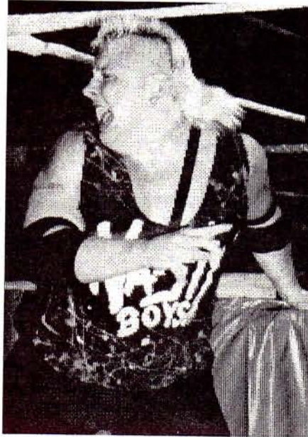
"NASTY BOY" BRIAN KNOBBS