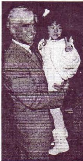
RIC FLAIR WITH TATSUMI FUJINAMI'S DAUGHTER

TV FORMAT CHANGE HIGHLIGHTS ROOKIES: New-Japan TV has made a change in its format. At the program's end, they give several minutes to highlight several undercard bouts. This gives viewers a chance to see several wrestlers who otherwise never get on TV. The one drawback was the recent title change in which Jushin Thunder Lyger re-won the strap from Norio Honaga. Instead of showing the match as one of their main events, they only showed the last minute as part of the highlight package.