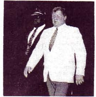
HARLEY RACE & MR. HUGHES

JULY 14, 1991 BALTIMORE, MARYLAND BALTIMORE ARENA