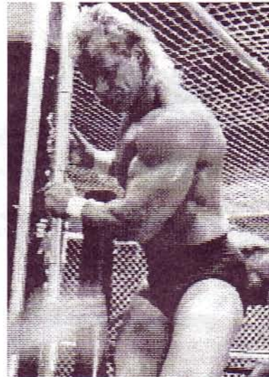
LEX LUGER, NEW WCW CHAMP

My personal score on the show was a 2.5 out of 10 live and on tape, a 1. Being there live makes you part of the show and that adds excitement to a card with nothing reaching three stars. Everything Dusty Rhodes did is so far beyond possible justification and explanation I cannot believe it. Production-wise, they are light years ahead of where they were just two years ago. But concerning action and overall product, WCW has totally lost sight of what the fans really want.