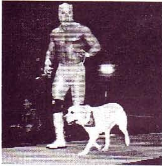
THE BASH'S OFFICIAL MASCOT